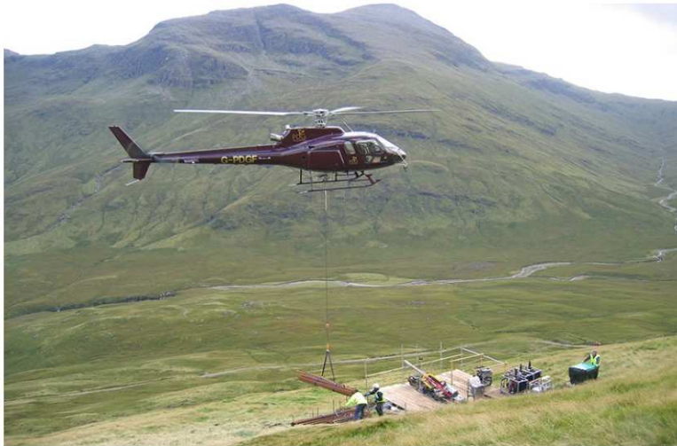
On site at Cononish in Scotland's Loch Lomond and Trossachs National Park

The bankable feasibility for Cononish was released this week, outlining a modest 23,000 ounce per annum gold-equivalent underground operation with an eight-year mine life. The cost to construct the 72,000 tonne per annum mine is estimated at £18.5 million (US$28.9 million) with the average life-of-mine grade of 11.8 grams per tonne keeping operating costs down to an industry low US$523/oz and all-in-sustaining-costs to $729/oz.