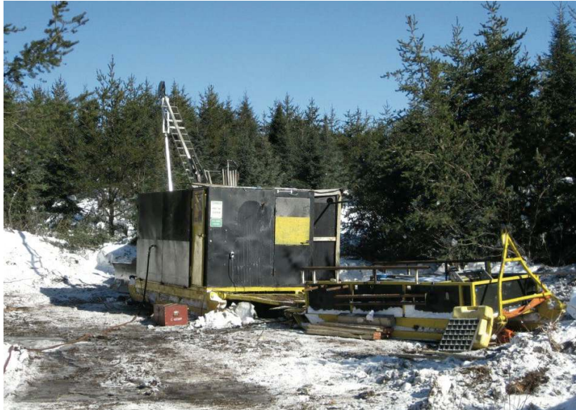
Diamond drilling at the Manitowadge graphite project

CSA Global was commissioned by Ardiden Limited to assess graphite mineralisation at the Manitowadge project and make recommendations on further exploration.