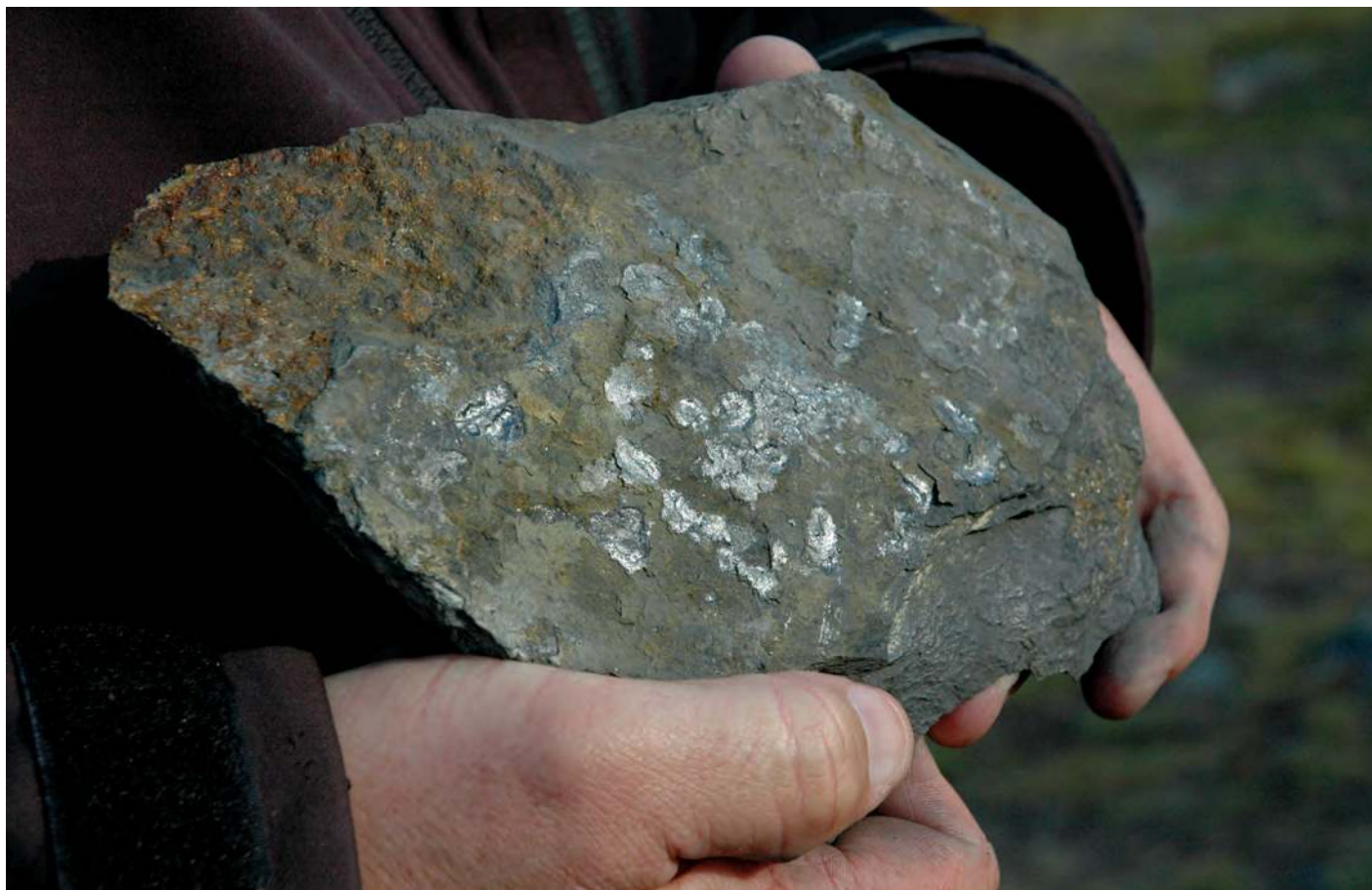
Investors and analysts are still coming to terms with what constitutes an economic graphite orebody

graphite exploration, as this provides undisturbed samples for thin sections and for metallurgical tests.